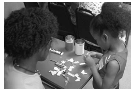
A mother watches as her daughter decorates her "spending" and "savings" cans.

Then the parents and children decorated cans and labeled them "Spending" and "Saving." The kids could take the banks home to help them use their money wisely.