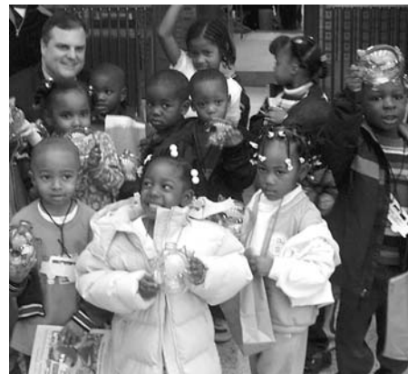
U.S. Senator Mark Pryor (back left) visited with children, talked about the importance of saving for an education, and gave each child a piggy bank to get started.

ing careers to support their families. We developed career tracks with local industry and our valued partners at Southeast Arkansas College (SEARK) and Phillips Community College of the University of Arkansas that promise good wages and the potential for