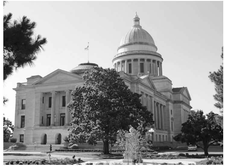
Rulings by the Arkansas Supreme Court in 2008 prompted the Attorney General to launch a crackdown on payday lenders.

Within three months, the number of payday lenders in Arkansas had dwindled to just 136. In August 2008, the Arkansas State Board of Collection